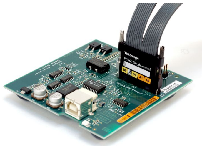
P5960 34-channel D-Max probe

The 17-channel P5910 provides flexible general-purpose probing, with support for 0.100 in. and 2 mm pin spacing, low input capacitance, and accessories for connecting to many industry-standard connections.